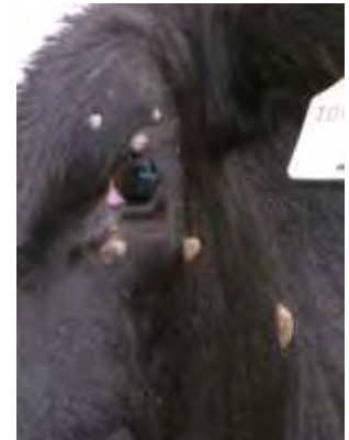
Warts around a calf's eye