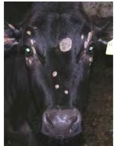
Calf with multiple ringworm lesions on head