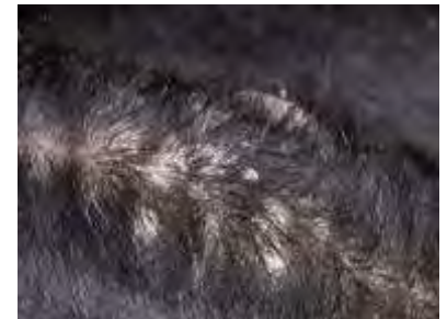
Warts on the tail head of a calf – an unusual location