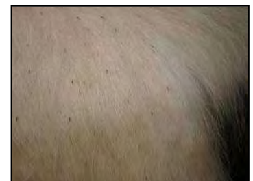
Lice on the skin of a calf